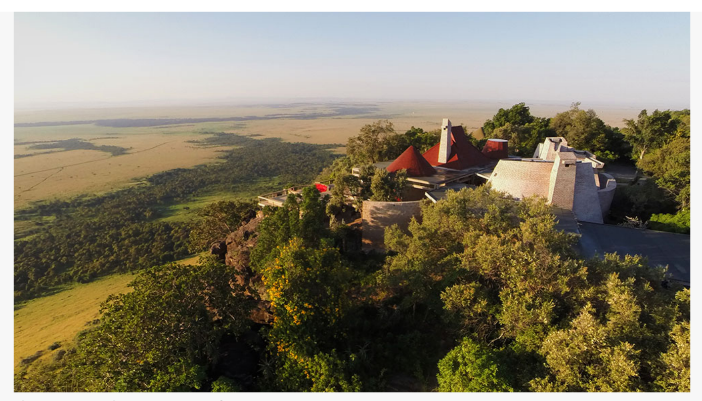
The view over the Maasai Mara from Angama Mara